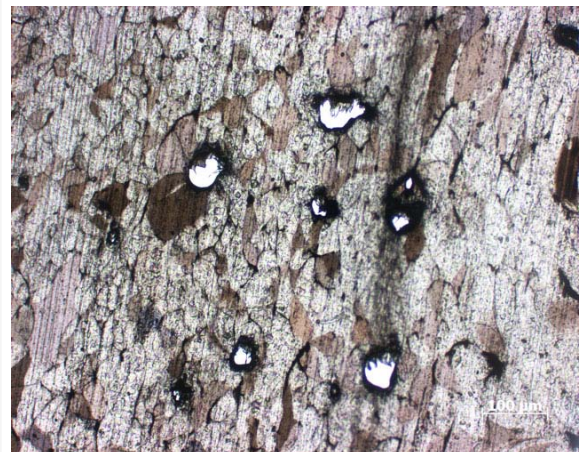
Chinese Copy Snorkel Material - distinctly grainy or crystal like structure where additive and colouring agents simply coat the base material. Consistency varies markedly throughout the part.

Under the microscope, the cheap Chinese snorkel material displays a distinctly grainy or crystal like structure where the additive/colouring agents simply coat the base material – rather than combining in a homogeneous structure.