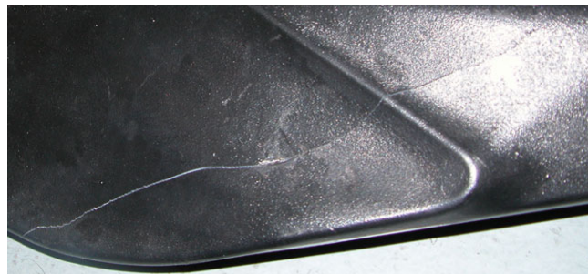
Impact Damage - Cracked snorkel body from a blow that barely marks the surface of a genuine Safari snorkel.

Put simply, the inferior Chinese manufactured copy product cannot be relied upon to deliver the level of component performance and durability that Safari customers have enjoyed for over three decades. Regardless of cost, there is no peace of mind with inferior products.